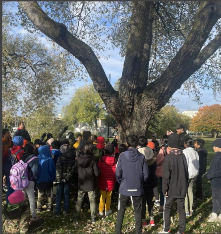
HUNDREDS OF YEARS THIS TREE HAS LIVED- WHAT HAS IT SEEN?