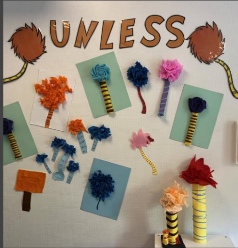
LEARNING ABOUT THE LORAX WHO SPEAKS FOR THE TREES